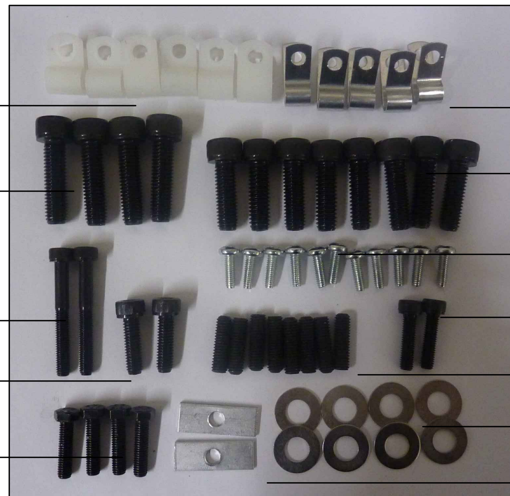
Cable Clamp Digital (6)