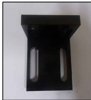
ED-3133 Angle Bracket (2)