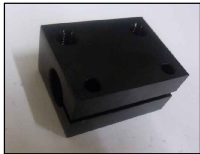
ED-3132 Scale Clamp (2)