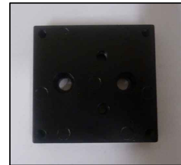
294-60650 Jacking Plate (2)